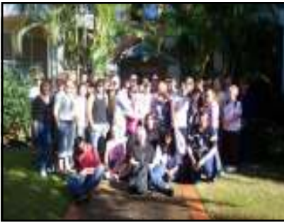
College camp 2005

This is the third consecutive year Northam Residential College is having an interstate camp. Trips to Tasmania in 2004 and Gold Coast 2005 has set the pace for the venue of this years camp, Canberra.